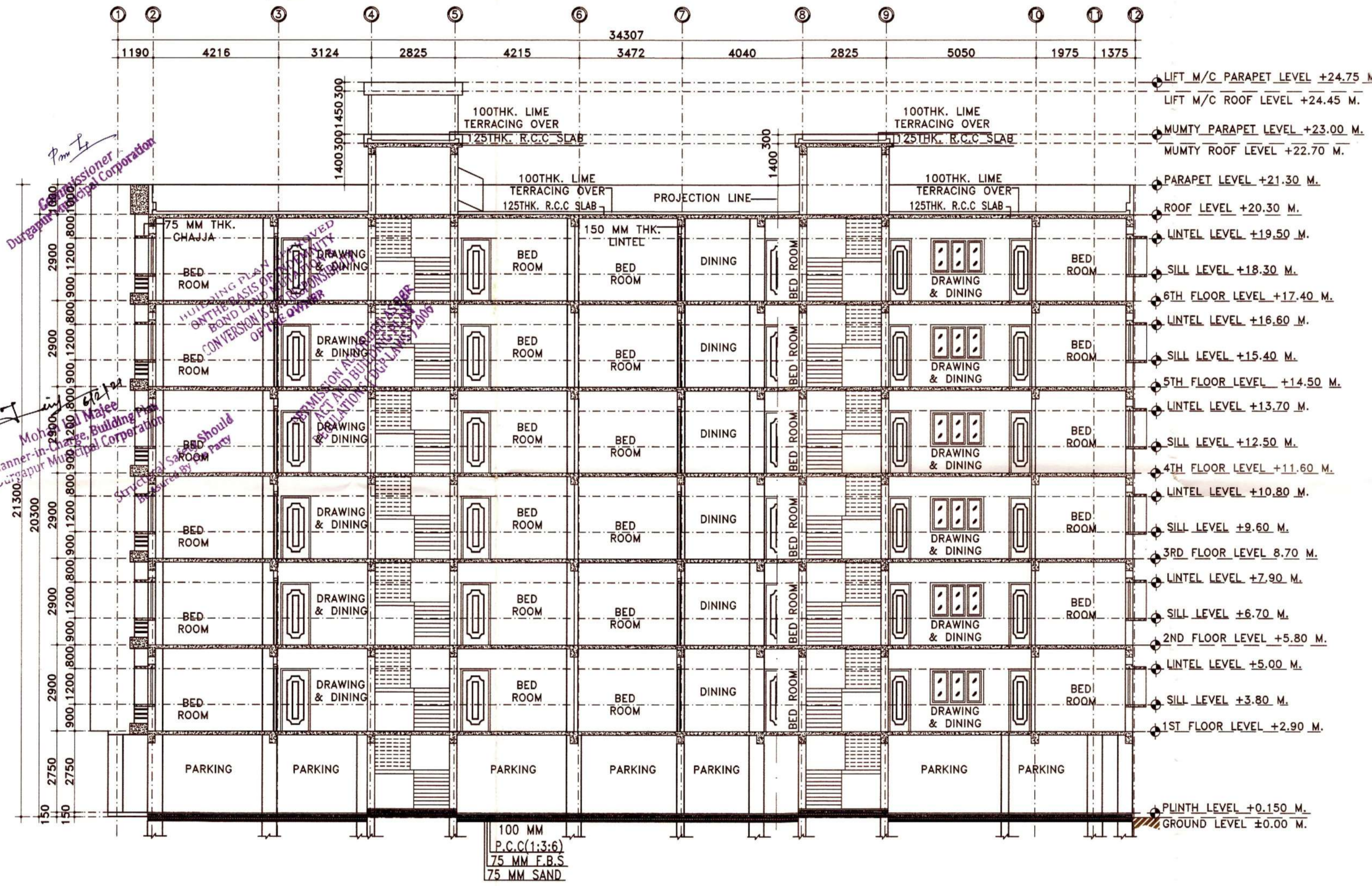
SECTION :-C-D SCALE: 1:100

PLAN NO-CB/234/19 RB/CB/ 1B/PB/HUT/ APN 19 20 20 26.11.20